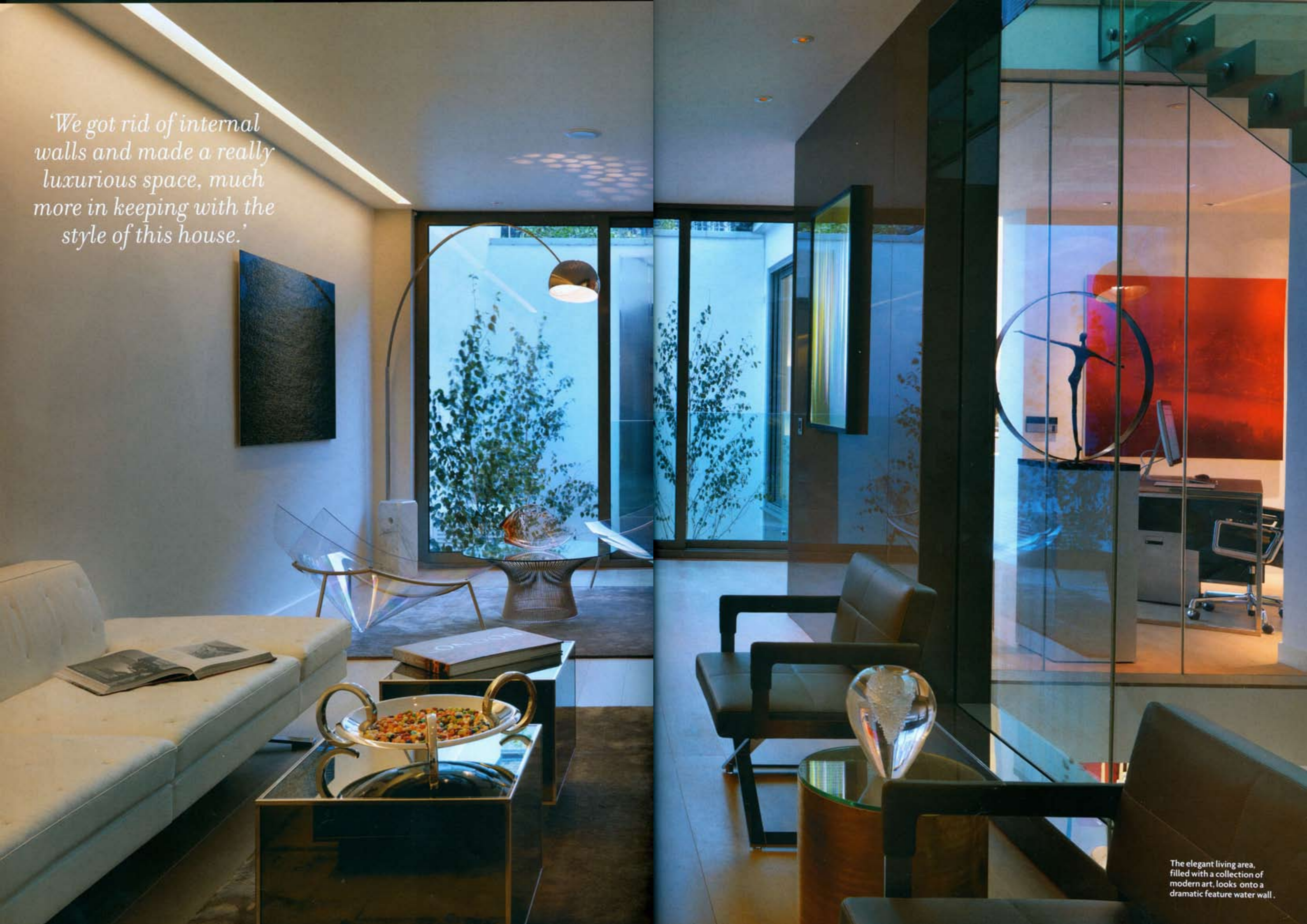
The elegant living area, filled with a collection of modern art, looks onto a dramatic feature water wall.

'We got rid of internal walls and made a really luxurious space, much more in keeping with the style of this house.'