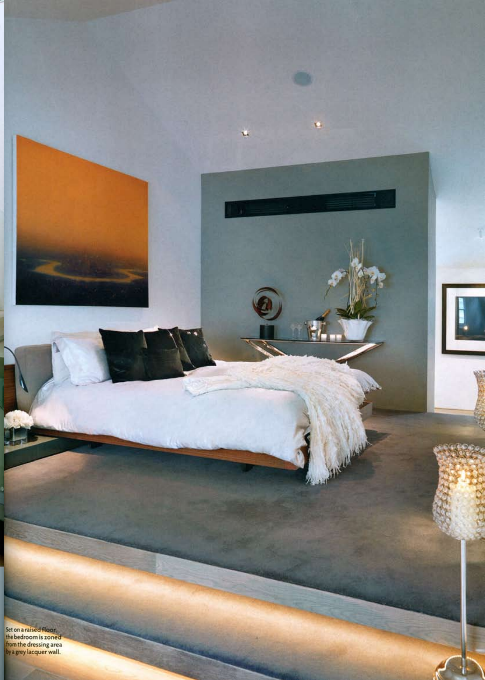
Set on a raised floor, the bedroom is zoned from the dressing area by a grey lacquer wall.

Just at that moment, the doorbell rings and Mark's client's niece, six-year-old Teal