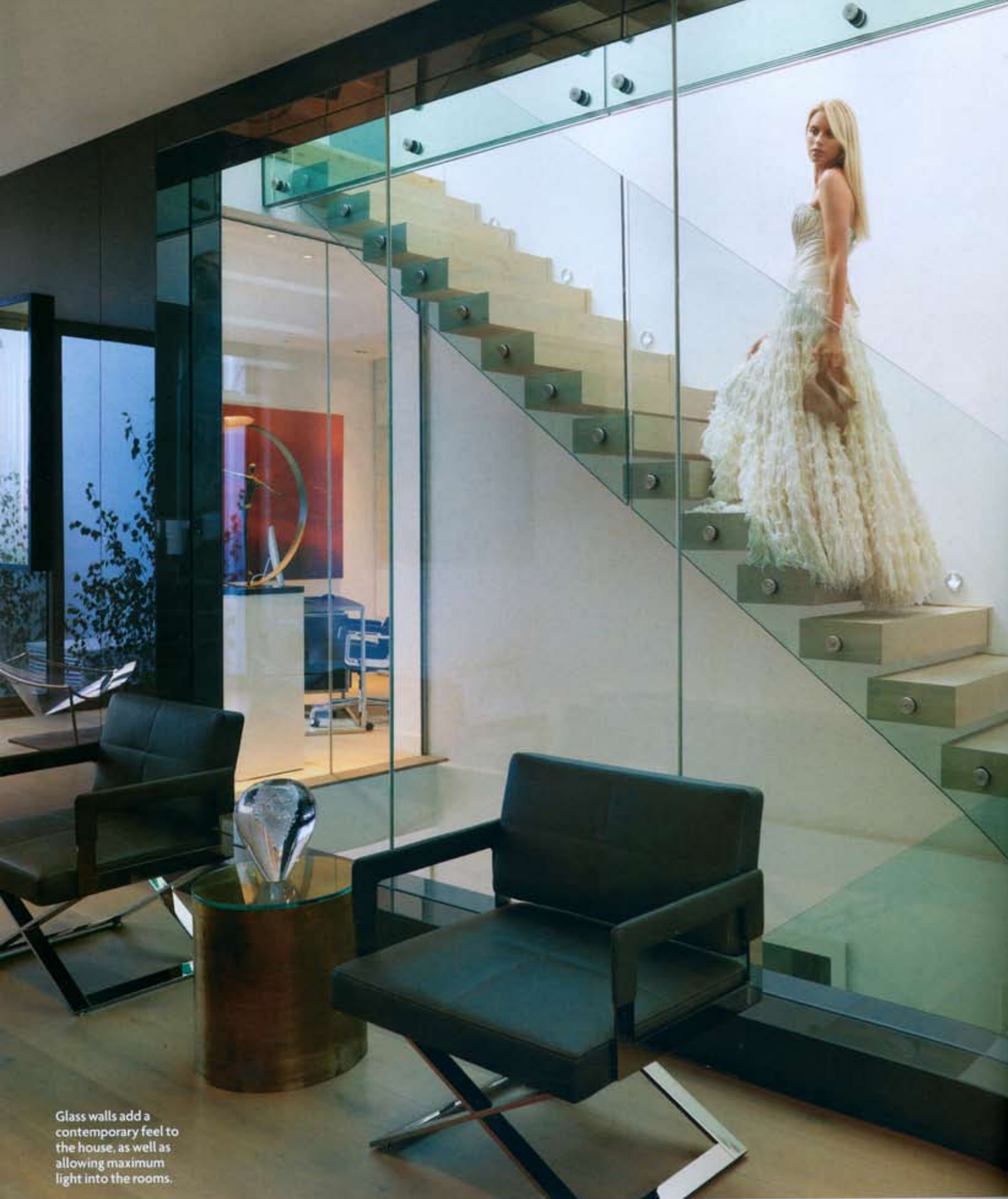
Glass walls add a contemporary feel to the house, as well as allowing maximum light into the rooms.

simplicity - there's nothing fussy, ornate or heavy.' As elegant as it is, however, this is a kitchen that is also designed for entertaining, with large integrated appliances and ample work surface for prep and serving. Plus there's even a micro-lift, hidden away in one of the cupboards, which speeds dishes upstairs.