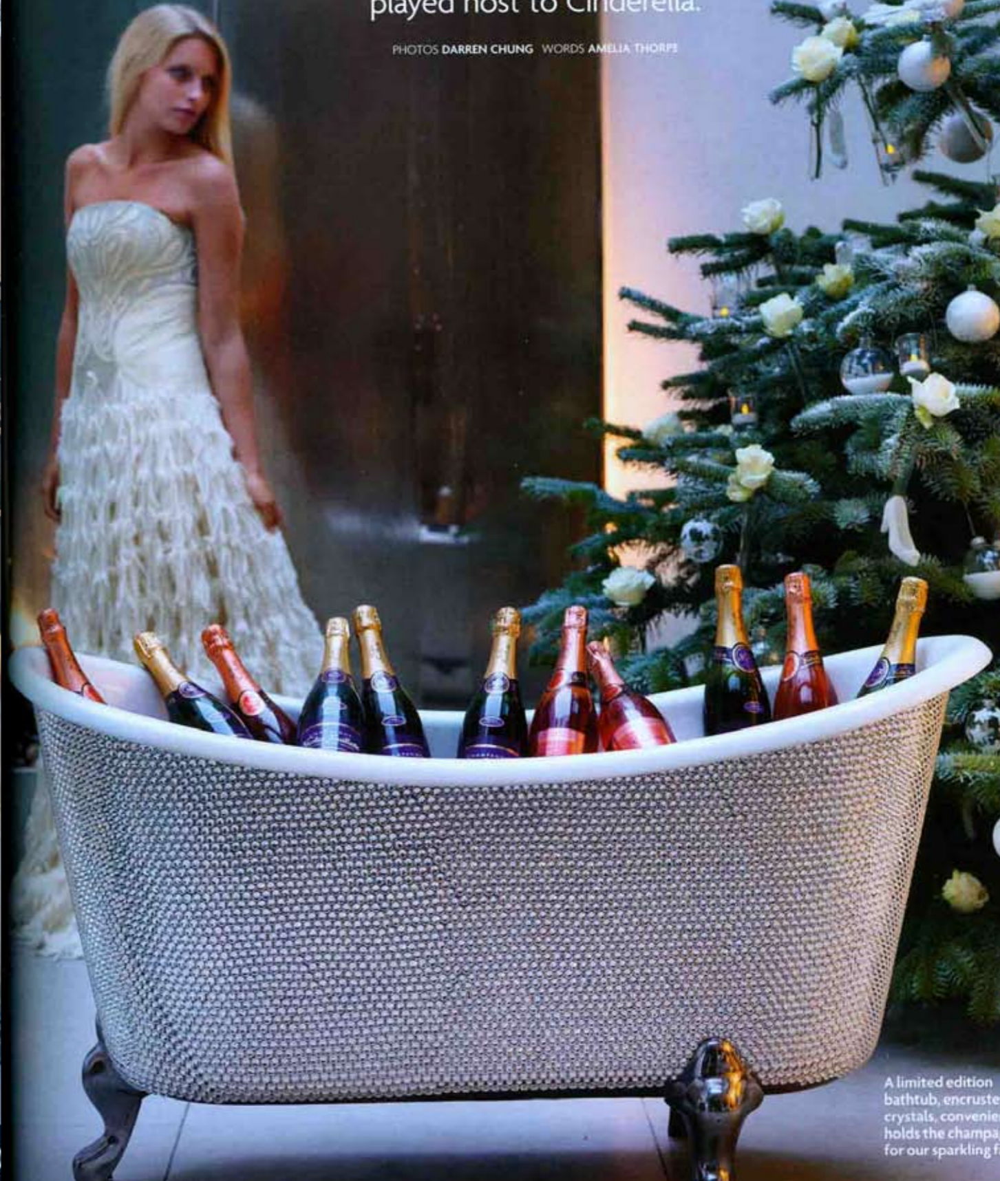
A limited edition bathtub, encrusted with crystals, conveniently holds the champagne for our sparkling fable!